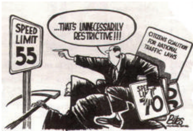
This cartoon appeared in the Milwaukee Sentinel in the Spring of 1984.